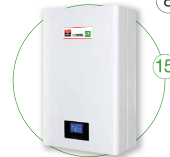
V-Tronic electric CH (combi)boiler