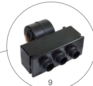
Hot air blower

A simple modification to save diesel and also an environmentally friendly solution: The V-Tronic electric central heating combi boiler or Compact Plus electric boiler can be placed in addition to the conventional Kabola boilers, as additional heating or keep it frost free. Basic advice is the models 3 to 6 kW. Optionally, the capacity can be set from 1 to 6 kW. More capacity is also possible, when needed. These electric central heating boilers with an optional WiFi thermostat to control.