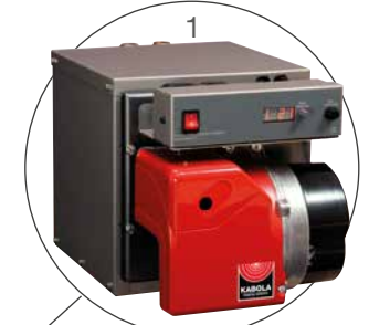
Kabola Compact 7